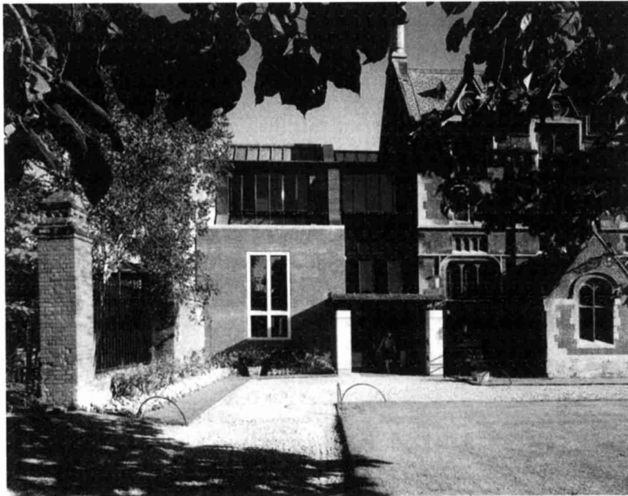
Freeland Rees Roberts Architects

As with all the libraries I am discussing, value has been added by the creation of a basement floor. In this case it extends under the full length of the building and contains the rare books and archives reading room, an office, and a store with compact shelving. Underneath there is drainage to a sump pit with an automatic pump, to avoid any risk of flooding. On the ground floor a new main entrance serves the whole building, with a lift, stairs and toilets in the extension, and an enquiry office and foyer leading to a large reading room (formerly the lecture rooms). This has a simple layout of rather tall bookcases in the centre and individual desks designed by the architect next to the windows. The surfaces pick up the colours in the original stained glass. The architect insisted on distemper for the walls because the natural pigment gives a more luminous effect than modern paint. The far end of this floor can be closed off to make a teaching room.