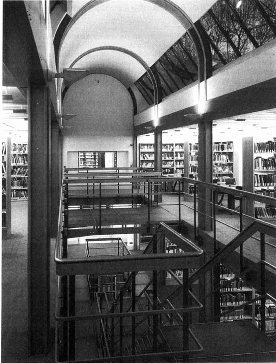
John Miller & Partners